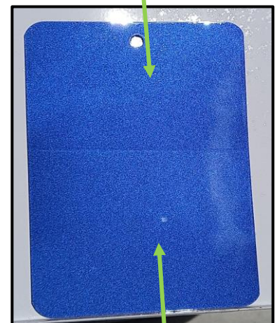
Wax & Grease Remover